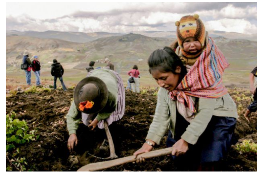
Farming in the birthplace of the potato, Andes mountains, Peru