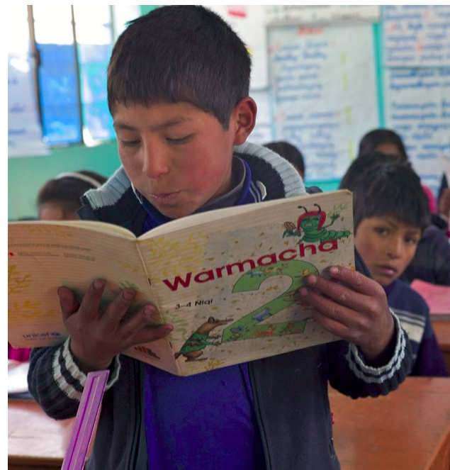
Peruvian boy learning to read Quechua