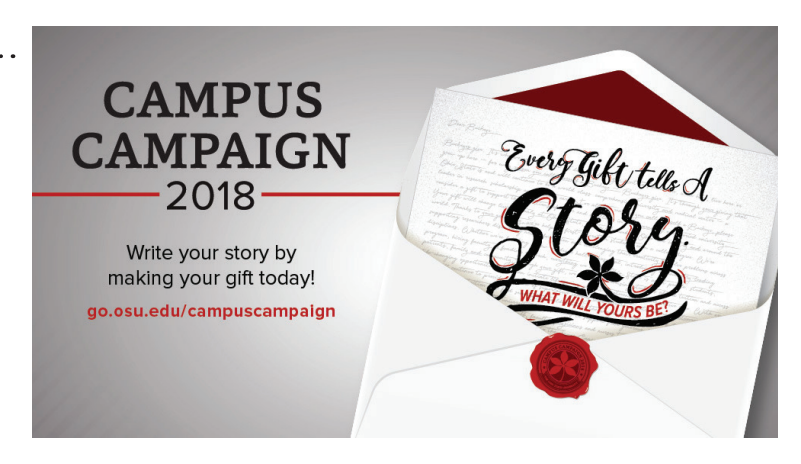
Thank you for supporting the Department of Spanish & Portuguese at go.osu.edu/campuscampaign!

This is a GEC second writing/social diversity course that focuses on generating ideas, drafting, and revising writing projects. These projects will be situated within the thematic context of literacy and related issues among Latin@s born in the United States and Spanish-speaking immigrants. This course is taught in English & Spanish.