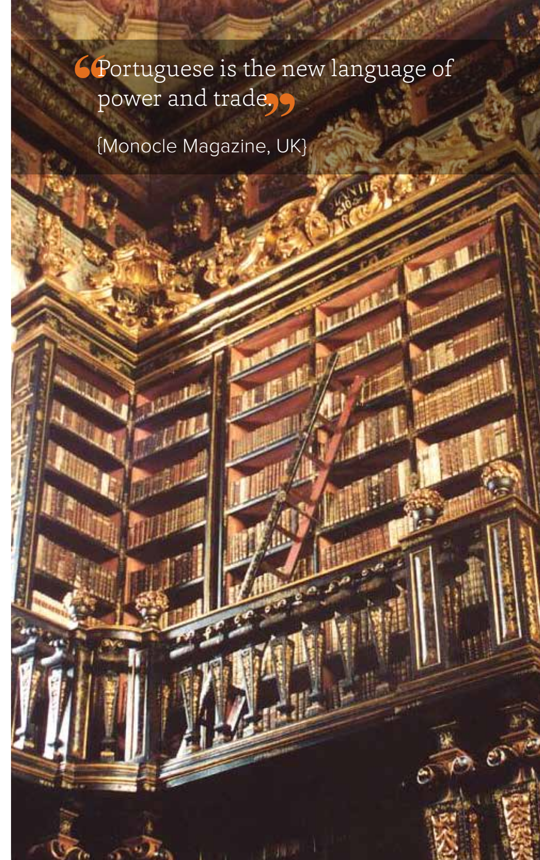
Biblioteca Joanina, Coimbra, Portugal

“Portuguese is the new language of power and trade,” [Monocle Magazine, UK]