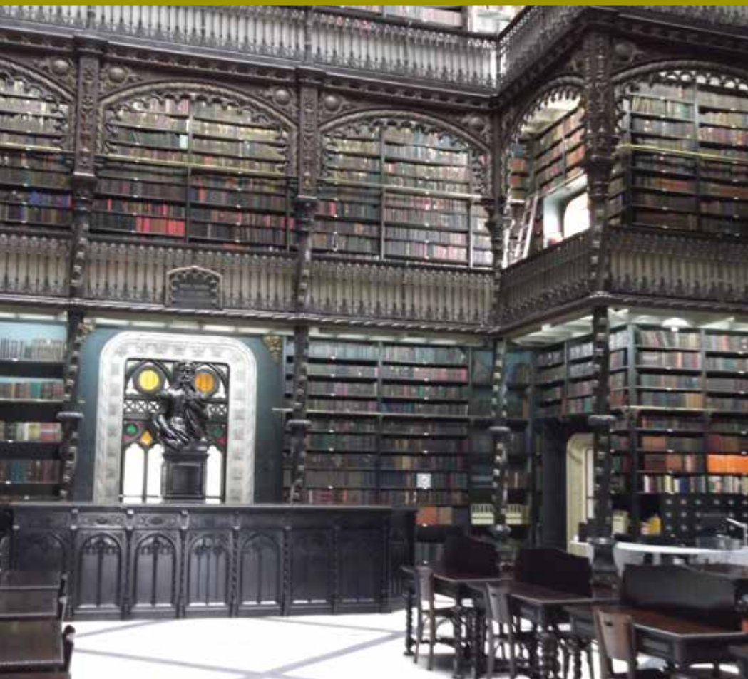
Real Gabinete Português de Leitura Rio de Janeiro