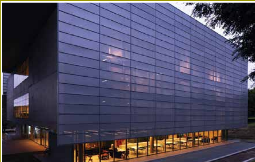
Biblioteca Brasileira José Mindlin, University of São Paulo, Brazil