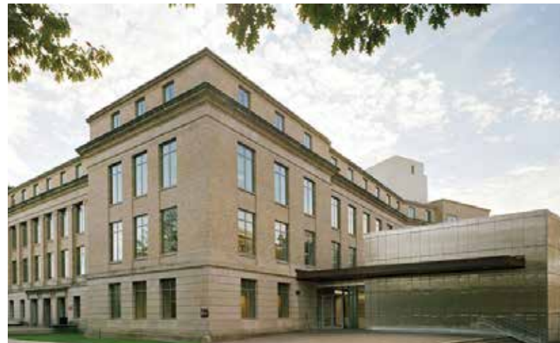
Hagerty Hall, Ohio State

email: spanport@osu.edu phone: (614) 292-4958 fax: (614) 292-7726